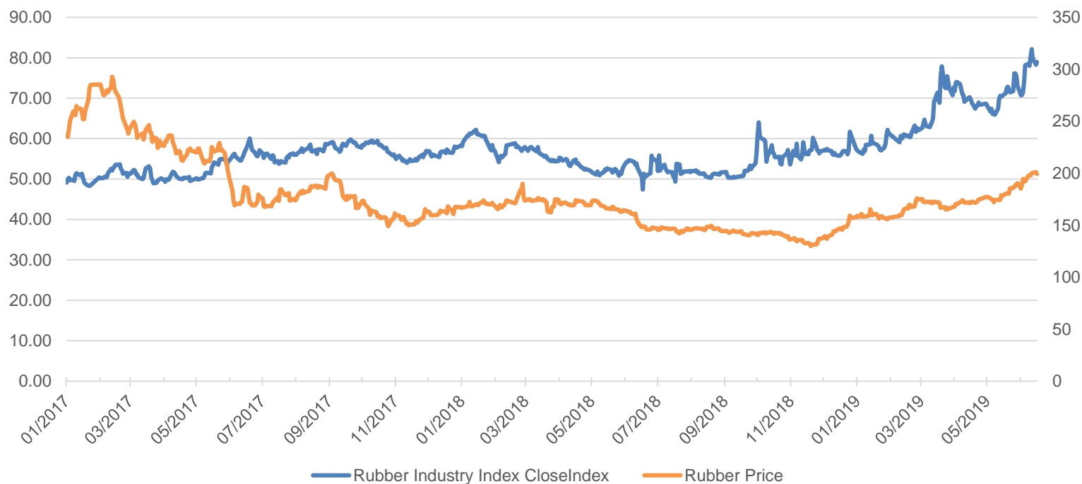
Vietnam rubber industry index versus Rubber price